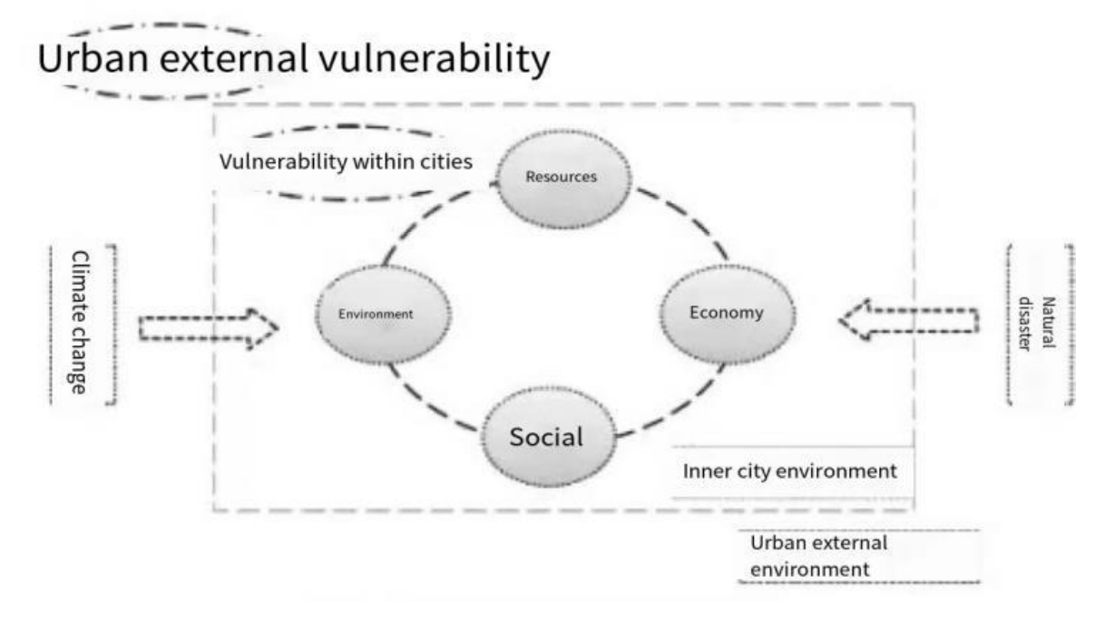
Figure 1. Types of urban vulnerability research

With the study of vulnerability in various disciplines, various analytical frameworks have emerged. This report views 'vulnerability' as enhanced risk of harm. (Cody Hochstenbach, Barend Wind & Rowan Arundel, 2021) In this paper, the research type framework of types of urban vulnerability research (Wang Yan, Fang Chuanglin & Zhang Qiang, 2013) will be combined with the framework of PAR model (Blaikie et al, 1994). This paper proposes an analysis of the internal vulnerability of private leasing from three aspects: social, economy and resources.