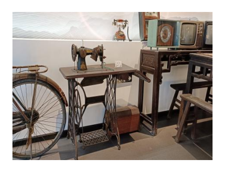
Figure 3. The Second Floor of the Qixian Village History Museum