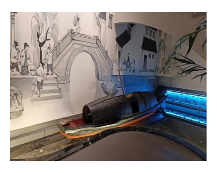
Figure 2. The First Floor Layout of Qixian Village History Museum

The first floor is the hall, which mainly introduces the development history of Qixian Village from the Sui Dynasty to the present. In addition to textual introduction, the exhibition hall combines physical objects, pictures, medias and other multi-modal forms of presentation, such as murals painted on the walls showing the daily life of the villagers, displayed in the stairwell with the Shaoxing water town flavour of the crow's nest boat and so on. In first floor, as the main exhibition hall, is designed in a styled that attaches importance to the innovative concept of modern exhibition and pursues the characteristics of simplicity and atmosphere, thickness and beauty. There are seven chapters in the exhibition hall, i.e., Folk Customs, Village History, Hundreds of Memories, Surnames of People, Frontier Leaders and Qixian, Turning Over and Towards the Future, etc. Each chapter has its own exhibits. Each chapter of the exhibits have their own characteristics, through the combination of graphics, physical display of the way all-round, three-dimensional display of Qixian Village in different periods of history, customs and social changes, but also to the local villagers and foreign tourists to provide an understanding window of the village of Qixian, Shaoxing City.