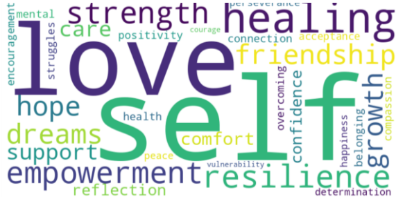
Figure 3. Themes in K-Pop lyrics addressing mental health

and prioritize their mental well-being. Beyond BTS, other K-Pop groups have also delved into mental health themes. SEVENTEEN's Hug provides a message of support and reassurance for those feeling overwhelmed, while IU's Dear Name explores feelings of pain and longing, offering a cathartic outlet for listeners. These songs not only resonate with fans on a personal level but also validate their emotions, reminding them that they are not alone in their struggles.