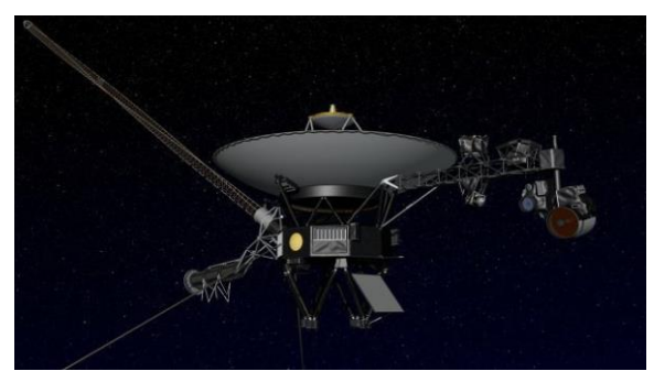
Figure 3. Microwave propulsion test in space

Researchers at the Northwest Polytechnic Institute in Xi'an, China, and employees of the American company Cannae also reported positive results. German scientists from the University of Technology published results that predictably confirmed the presence of microwave thrust 3. China has successfully tested a microwave propulsion vehicle aboard the Tiangong-2 space laboratory.