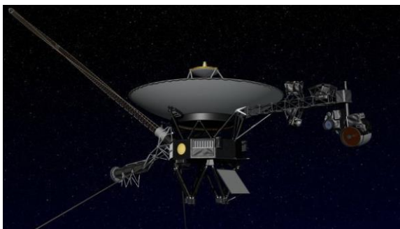
Figure 3. Microwave propulsion test in space

Researchers at the Northwest Polytechnic Institute in Xi'an, China, and employees of the American company Cannae also reported positive results. German scientists from the Dresden University of Technology also published results that predictably confirmed the presence of microwave thrust 3 . China has successfully tested a microwave propulsion vehicle aboard the Tiangong-2 space laboratory.