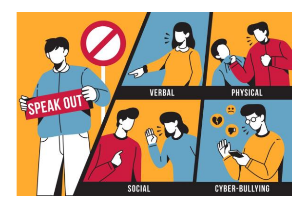
Figure 1. Childhood bullying

One prevalent form of violence on campuses is physical aggression. This includes physical fights, assaults, and acts of violence that result in physical harm to individuals. Physical aggression can occur between students, as well as between students and teachers or other staff members. These incidents can range from minor altercations to more serious acts of violence.