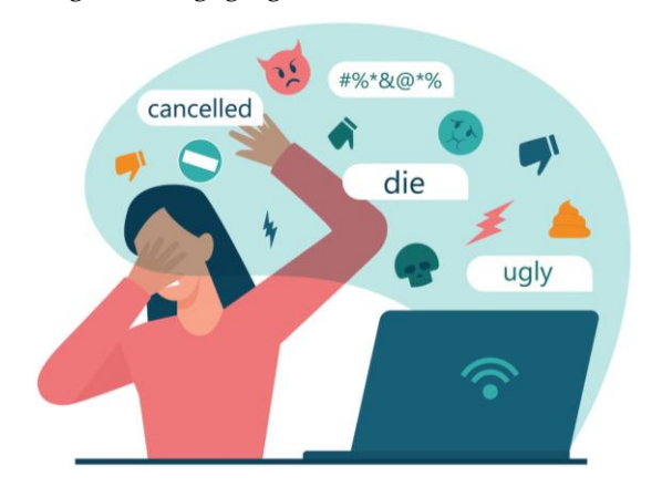
Figure 2. Cyberbullying

Cyberbullying has also become a significant concern in recent years due to the widespread use of technology and social media platforms. Cyberbullying involves the use of digital platforms to harass, threaten, or humiliate individuals. It can take the form of spreading rumors, posting derogatory comments or images, or engaging in online harassment.