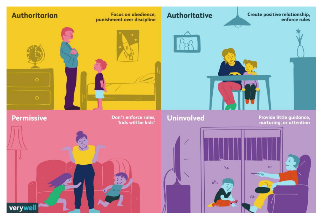
Figure 5. Four Parenting styles

Authoritative parenting, which combines warmth and support with clear expectations and boundaries, is associated with positive emotional regulation outcomes in children. Parents who use this style provide emotional support and guidance, encourage open communication about emotions, and teach effective coping strategies. This creates a secure and nurturing environment that promotes children's emotional regulation abilities.