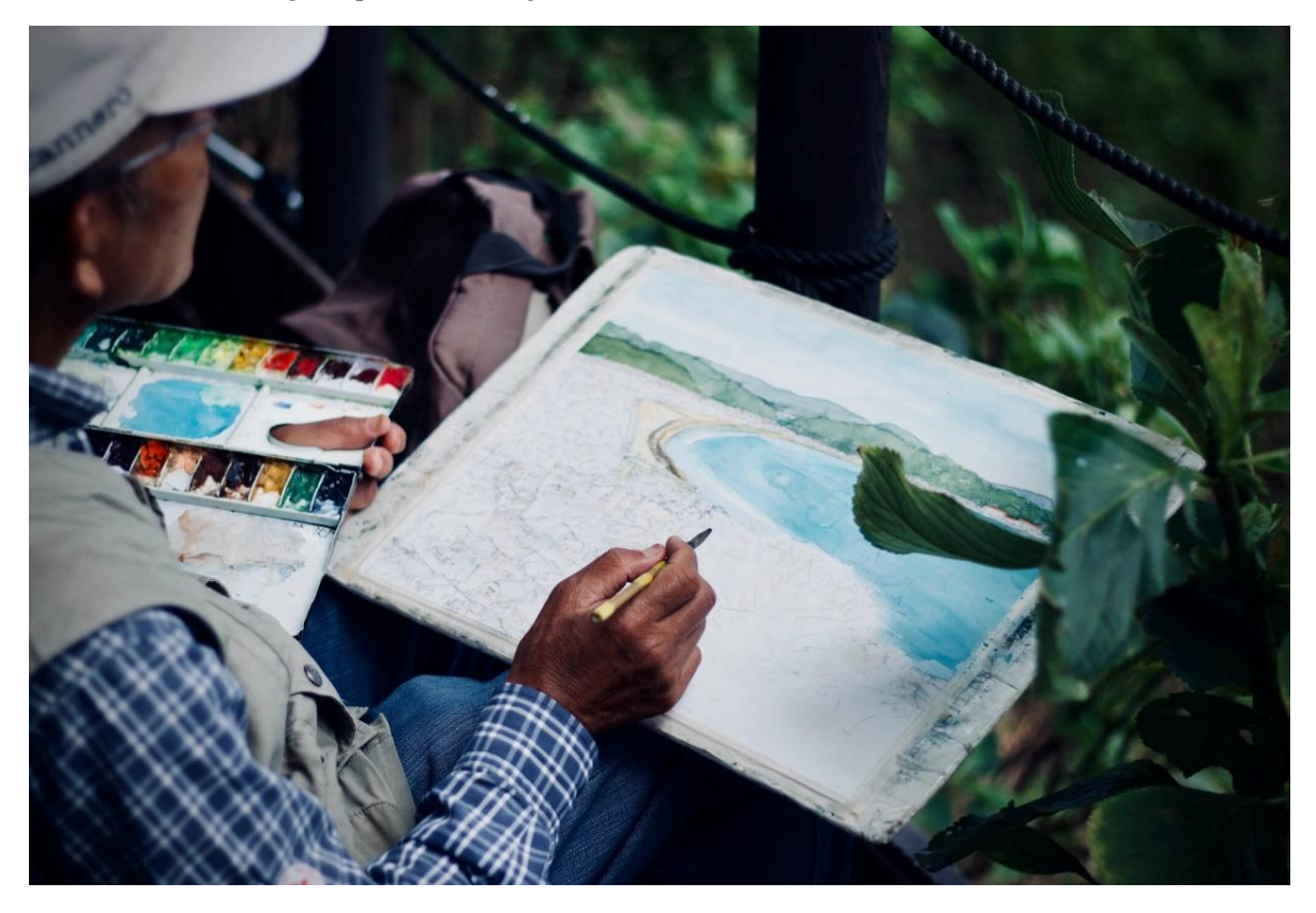
Figure 1. Elder—Improve Memory and Mental Health: 25 Brain Games for the Elderly

Your elderly loved one may find enjoyment in these endeavors due to their inherent creativity or the desire to create heartfelt gifts for family and friends.