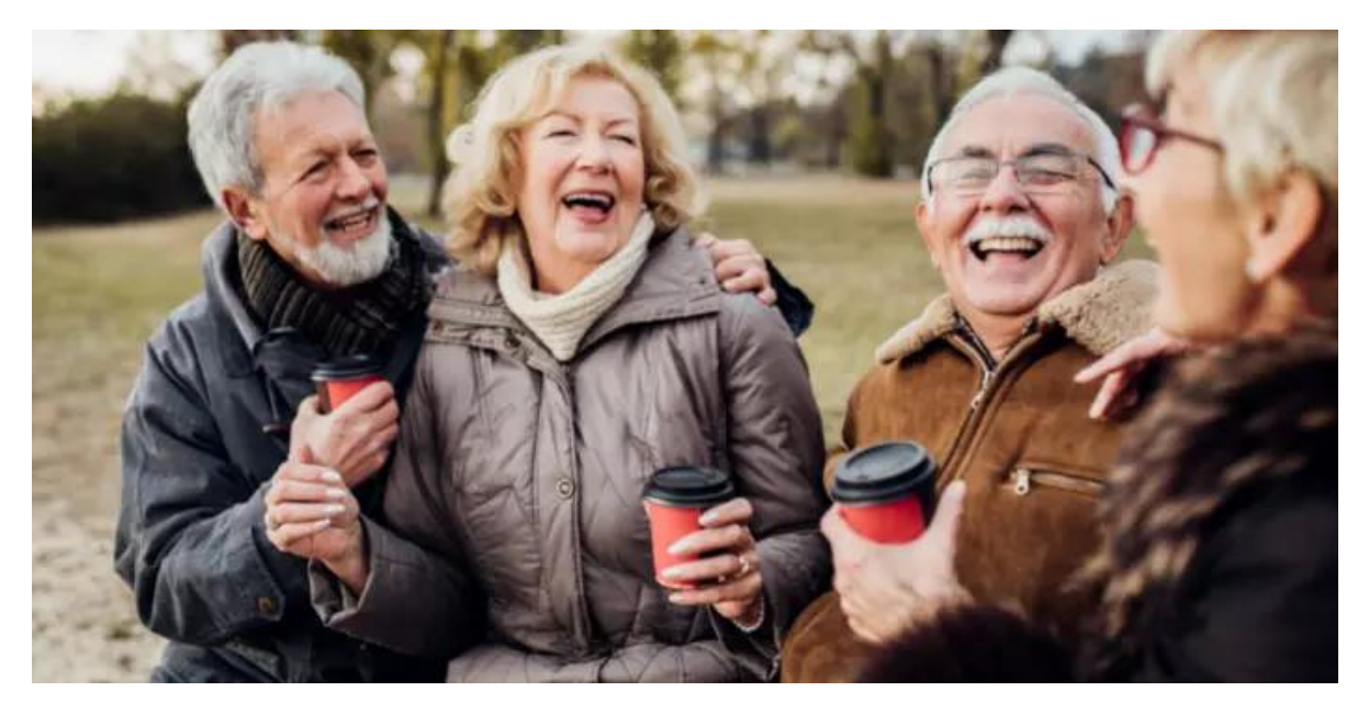
Figure 5 . Benefits of social activities for seniors

Participating in social activities, such as group outings, educational programs, or cultural events, promotes cognitive stimulation by challenging individuals to engage in new experiences, learn new information, and interact with others. Intellectual discussions and activities, such as book clubs or group discussions, provide opportunities for mental engagement and the exchange of ideas, stimulating cognitive processes related to memory and critical thinking.