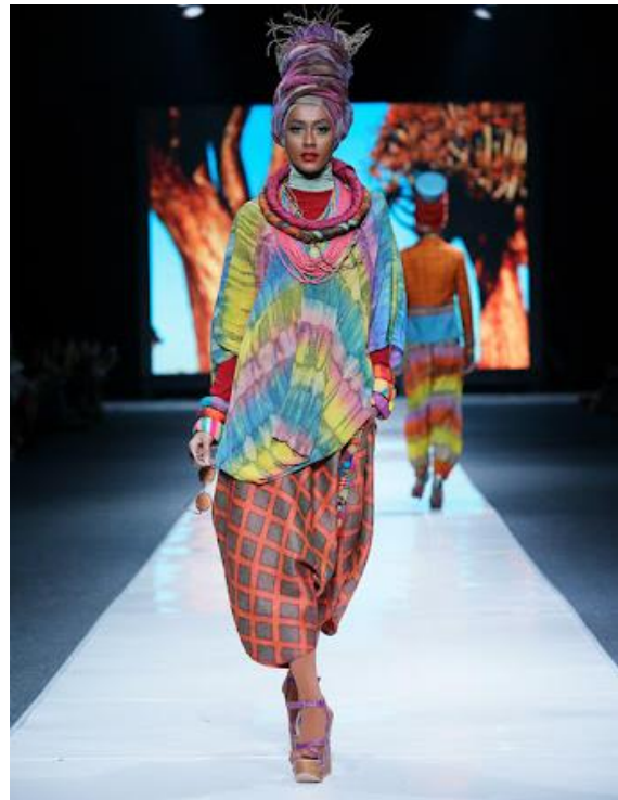
Figure 1. Dian Pelangi Spring 2013 Jakarta Fashion Week

blending them with luxurious fabrics and contemporary silhouettes, thus making traditional Indonesian wear more accessible and appealing to younger generations.