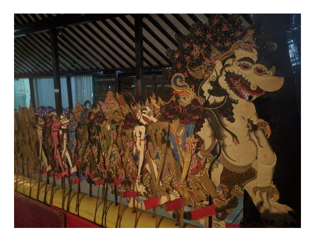
Figure 1. Ramayana in the shadows: Wayang Kulit (Shadow Puppetry) in Indonesia