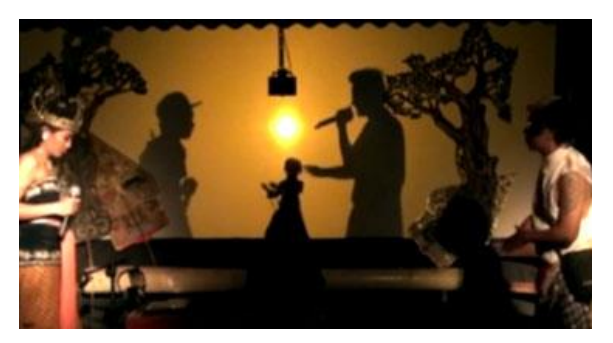
Figure 5. Wayang Hip Hop (2012)

Wayang Hip Hop performances offer a modern of classic reinterpretation Wayang tales, resonating with young audiences and urban communities. Bv combining traditional storytelling with contemporary artistic expressions, Wayang Hip Hop revitalizes Wayang as a relevant and engaging art form for today's generation.