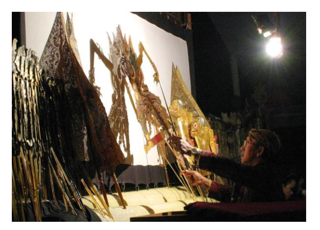
Figure 3. Dalang (puppeteer)

Traditionally, Wayang performances are conducted during religious festivals, community gatherings, and special occasions. They feature intricately crafted puppets, meticulously carved from buffalo hide or wood, and brought to life by skilled puppeteers known as dalang. Accompanied by a gamelan orchestra, the dalang manipulates the puppets behind a backlit screen, casting dynamic shadows that captivate audiences and evoke a sense of mystique.