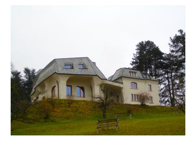
Figure 18. Rudolf Steiner Halde, a space for Eurythmy