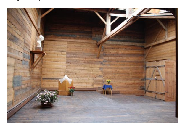
Figure 20. The Atelier of the Schrenerei offered an abstemious space for the final six months of Rudolf Steiner's life