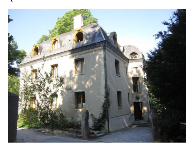
Figure 14. Haus Friedwart is the closest visitor accommodation to the Goetheanum

Haus Friedwart (a rather unfortunate name in English) is the closest visitor accommodation to the Goetheanum (Figure 14). It offers modest guest-house style accommodation, and is just paces from the Goetheanum. The Goetheanum is not well serviced for visitor accommodation; there is no premium accommodation. Kloster Hotel (once a monastery) near the Dornach rail station is alternative and offers monastic-style accommodation; local Anthroposophists may also provide visitors a spare room.