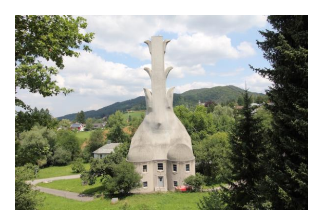
Figure 6. The 'boiler room' piped hot water for heating to the Goetheanum I and II

He explored the sculptural possibilities of the medium and it was fireproof. Heizhaus is an architectural and sculptural curiosity. It is the most phallic of Rudolf Steiner's creations. Heizhaus was Rudolf Steiner's opportunity to reimagine an otherwise solely utilitarian piece of urban infrastructure. Rudolf Steiner drew on his experience of the sculptural possibilities of reinforced concrete when he came to design a fireproof Goetheanum II.