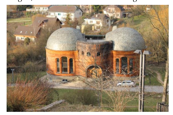
Figure 5. The Glass House was used for fabricating the etched glass windows of Goetheanum I and II

House is the closest surviving relative of Goetheanum I (and a small version thereof) (Figure 5). The Glass House is now home to the Agricultural Section of the School of Spiritual Science. The outer walls are clad in timber shingles, the domes are clad in Norwegian slate.