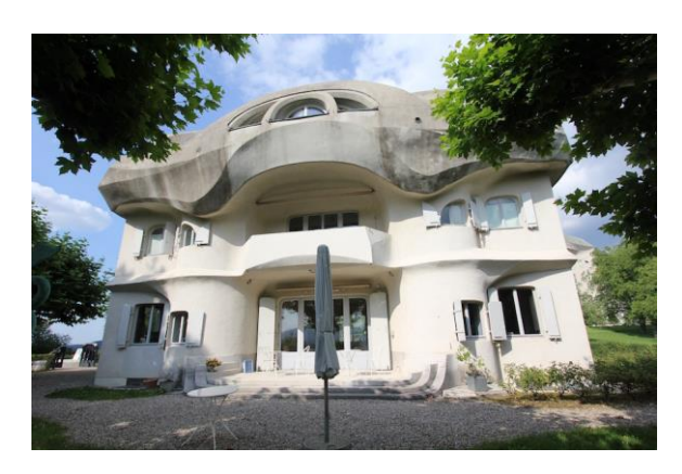
Figure 8. Haus Duldeck, the house of the dentist Emil Grossheintz, now the Rudolf Steiner Archiv

Haus Duldeck is presently home to the Rudolf Steiner Archiv. The Goetheanum and Haus Duldeck, designed by Rudolf Steiner a decade apart, both of reinforced concrete, are two of his most successful and innovative buildings, and the best examples of his novel organic architecture where right angles are eschewed and the shapes are sculptural and soft, despite the medium of hard concrete.