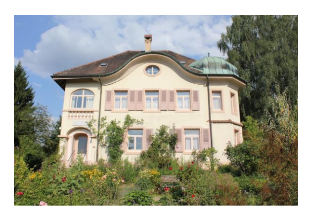
Figure 2. Haus Hansi, Rudolf Steiner's home located halfway between the station at Dornach and the Goetheanum at the top of the Dornach hill

From the rail station a visitor will head up the Dornach hill. Half-way up is 'Haus Hansi', the stylish home of Rudolf Steiner (Figure 2). The house predates Steiner's time in Dornach (and is a fine example of provincial architecture; it is not an example of Anthroposophic architecture). This was Steiner's home from 1914 until his illness saw him withdraw from public life on 28 September 1924 (Paull, 2018b). The gracious high-set, free-standing, two storey house with a pleasant outlook (to the village of Dornach) and front and rear gardens, was a significant upgrade on the Berlin flat that had been home for Steiner from 1902 (he finally relinquished the Berlin flat in 1923). Rudolf Steiner spent the last six months of his life in the rudimentary studio annexed to the Schrenerei rather than the salubrious Haus Hansi.