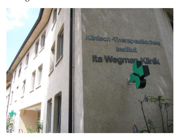
Figure 17. The Ita Wegman Klinik is an Anthroposophic medicine hospital

The Ita Wegman Klinik (formerly the Klinisch-Therapeutisches Institut) has served Anthroposophists and others for a century (Figure 17). It is located in Arlesheim, a village in walking distance of the Goetheanum. It is the largest hospital devoted to Anthroposophic medicine. During the illness of Rudolf Steiner's last six months, Ita Wegman treated him at his Schreinerei studio, from September 1924 through to his death on 30 March 1925.