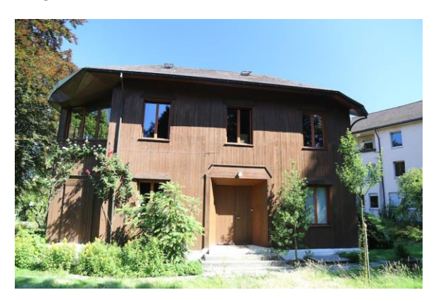
Figure 16. Ita Wegman Haus, a modest timber structure in Arlesheim (nearby Dornach), now housing the Ita Wegman Archive