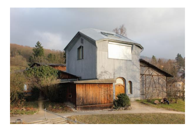
Figure 7. The 'high studio' suited the tall Representative of Humanity sculpture

The High Studio is a work-space adjacent to the Schreinerei (Figure 7). Its high ceiling offered a space to create the Representative of Humanity sculpture (Halle & Wilkes, 2010). The artwork is a timber sculpture nine metres tall. It was a joint and collaborative work of Rudolf Steiner and the English sculptor Edith Maryon (1872-1924). The sculpture survived the Goetheanum I fire of New Years Eve 1922/23 and it is now housed in Goetheanum II.