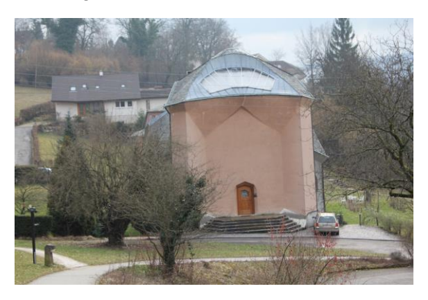
Figure 12. The stark de Jaager house built for the family of the artist Jacques de Jaager

This home was built for dual purposes: as a studio to house the work of the deceased sculptor (a kind of macabre mausoleum without the body) and a residence for the artist's wife and daughter.