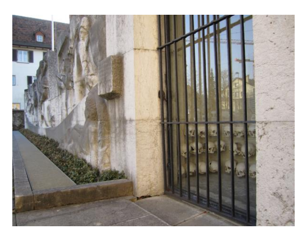
Figure 1. Welcome to Dornach: The 'bone house' with skulls of the Battle of Dornach (1499)

The Swiss won the conclusive Battle of Dornach in 1499, against the Habsburg Empire (the Swabian War, aka the Swiss War). The frieze of victory and the skulls of the 'bone house' commemorate the event. They are a reminder that Switzerland's neutrality is a hard won neutrality (military service remains compulsory for Swiss males, arms are retained at home, so the population is armed against invasion). The Beinhaus of Dornach provides a visitor some historical context for a visit.