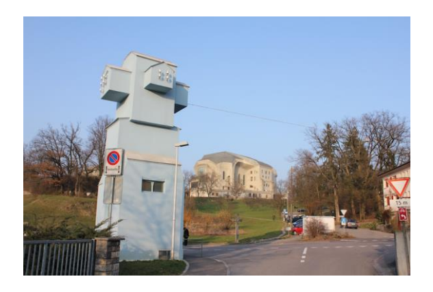
Figure 11. The electrical transformer for the Goetheanum precinct

The new Anthropop colony on the Dornach hill needed electricity. A transformer was an essential piece of civic infrastructure. Rudolf Steiner took up the challenge to make 'his' transformer distinctive and a work of art, rather that 'just' a utilitarian and boring 'vanilla flavoured' transformer (Figure 11). The resulting structure must be the most curious and whimsical transformer in the country. A visitor who took the path to the right from Haus Hansi will pass the transformer (it is opposite the Coffee shop on the corner, across from Kaffee und Speisehaus, 1931) on the path to the Goetheanum.