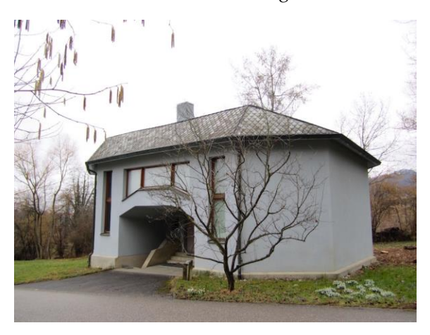
Figure 15. The 'book house'; proceeds from book sales were a major source of income for Rudolf Steiner

for Rudolf Steiner in his lifetime. Rudolf Steiner's publishing house began in Berlin and the storehouse of books moved from Berlin to Dornach (Paull, 2019). The publishing house is a timber construction dominated by the large gaping mouth at the front (in the style of Luna Park) (Figure 15). After his death Marie Steiner fought to retain the copyrights and income from Rudolf Steiner's books. A large selection of new Steiner books is available at the bookshop located in the foyer of the Goetheanum, mostly at premium prices. There are one or several secondhand bookshops close by Goetheanum precinct. Much of Rudolf Steiner's body of work is long out of copyright. Many of Steiner's lectures are now available free on the World Wide Web at rsarchive.org.