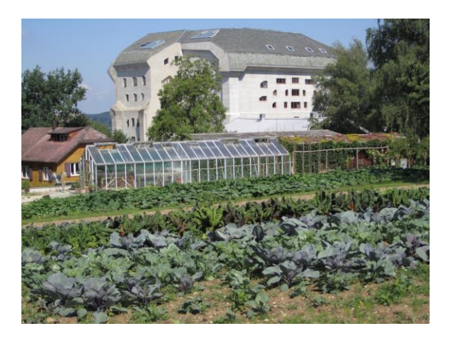
Figure 19. Biodynamic horticulture is practiced at the Goetheanum