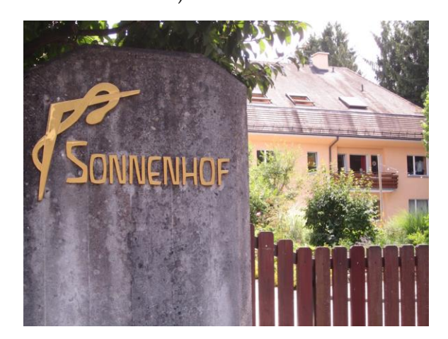
Figure 13. Sonnenhof Arlesheim continues the impulse to serve mentally disabled children

history of Biodynamics as the site of Rudolf Steiner first introducing the Biodynamic preparations (to Ernst Stegemann and Ehrenfried Pfeiffer).