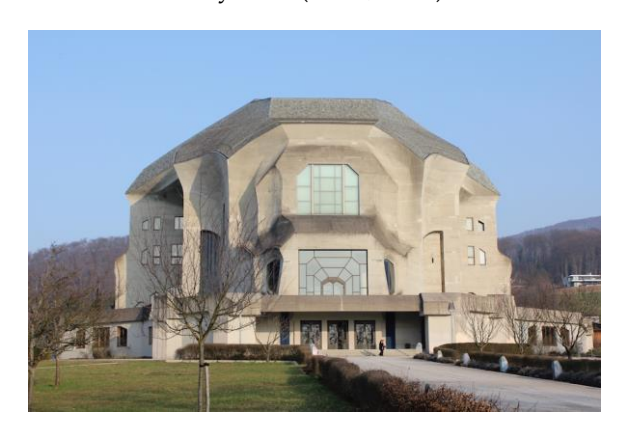
Figure 3. The Goetheanum, headquarters of the General Anthroposophical Society and home of the School of Spiritual Science

The present Goetheanum II, built on the site of first, never reverberated with the footfall of Rudolf Steiner. He saw it only it in his 'mind's eye', he created a plaster model (held in the Rudolf Steiner Archiv), and reconstruction had barely begun by the time of his death, but was well advanced by 1926 (Paull, 2022).